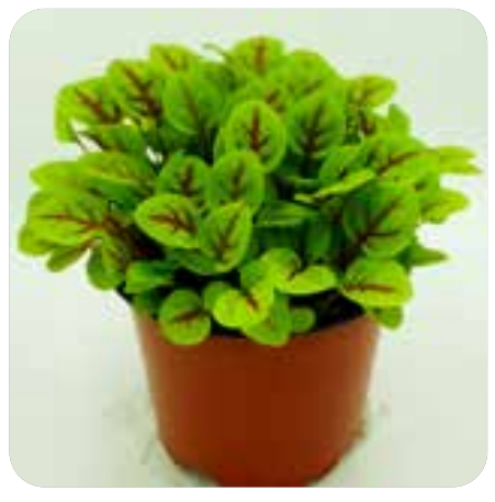
Sorrel - Micro Vein

A perennial herb that grows to approximately 50cm-60cm tall. Similar flavour to French Tarragon and easier to grow, but less pungent than Russian Tarragon. Tagetes lucida (500-700 s/gm)