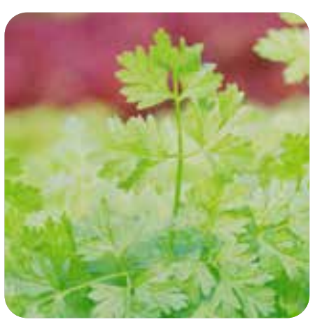
Chervil - Curled

Amaranth is a stunning deep red microgreen with a beetroot like flavour. Bright pink/red stem colour, with slender elongated cotledons. Excellent micro herb for use as a garnish. Amaranthus caudatus (approx. 1,600 s/gm)