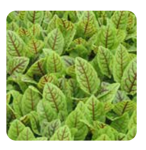
Sorrel - Red Veined

Woody, branching perennial herb that dies back in autumn but shoots again in spring. Thymus vulgaris (5000-6000 s/gm)