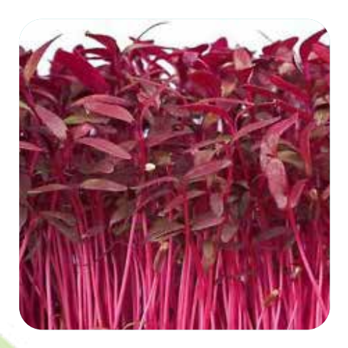
Amaranth - Red Garnet

Amaranth is a stunning deep red microgreen with a beetroot like flavour. Bright pink/red stem colour, with slender elongated cotledons. Excellent micro herb for use as a garnish. Amaranthus caudatus (approx. 1,600 s/gm)