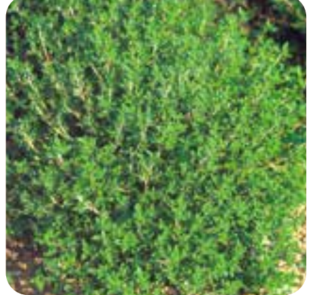
Thyme - Winter

A variety of red veined sorrel specifically selected for its perfect appearance at the micro-herb stage. As a micro, its leaves have a distinct red veins and a refreshing citrus taste. Rumex sanguineus (1200-1500 s/gm).