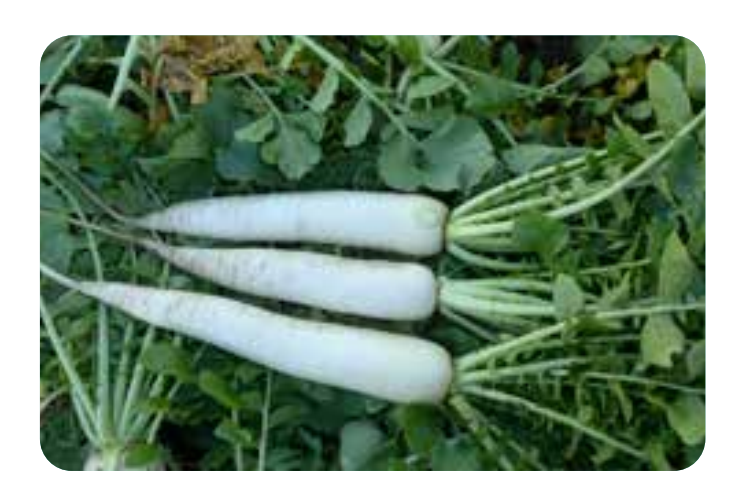
April Cross F<sub>1</sub>

Market standard all-white Japanese style daikon radish. Approx. 40cm x 6cm root. May bolt in spring and early summer.