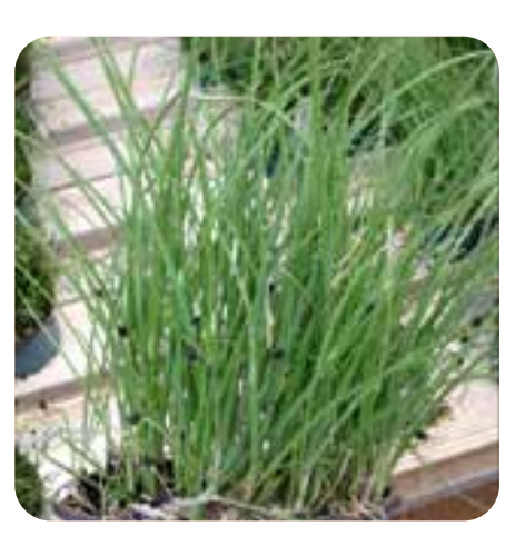
Chives - Garlic

Curled Chervil produces fragrant, small leaves on a stemmed plant. Chervil is not unlike parsley at first appearance, but with sweeter and smaller leaves. Anthriscus cerefolium (400 - 550 s/gm)