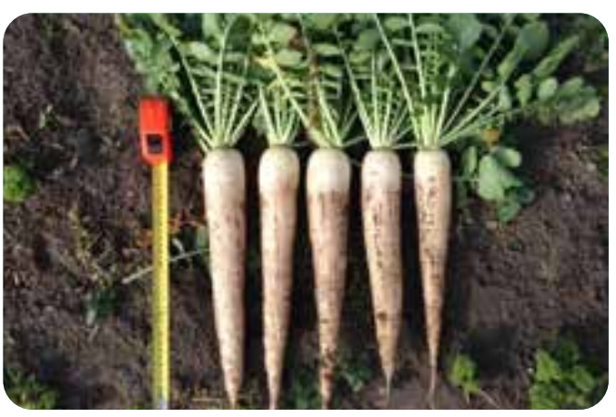
Kings Cross F<sub>1</sub>

Market standard all-white Japanese style daikon radish. Approx. 40cm x 6cm root. May bolt in spring and early summer.