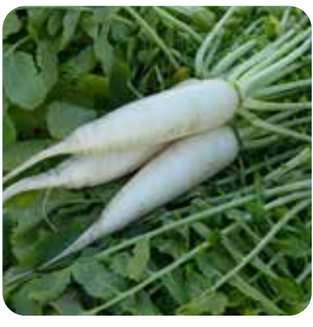
Relish Cross F1

Geisha Girl No. 2 is a slow bolting variety which produces a long tapered very white smooth root with a light green shoulder. It has excellent uniformity and medium sized tops. Market standard for this type.