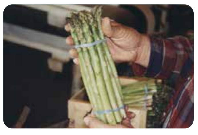
Early California F1

A deep purple coloured asparagus variety with high and exceptional flavour. The spears are significantly sweeter than the green varieties and are generally very uniform in appearance. It can produce some very thick spears, reducing plant spacing can help limit this if required. Seed is imported for confirmed orders only.