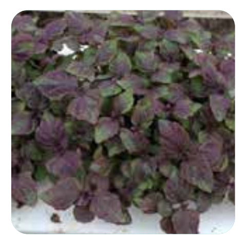
Shiso - Red

A common Asian herb also known as Perilla. Red Shiso has an anise flavour and is slightly less spicy than the green variety. Well suited for micro herb production. Perilla frutescens (approx. 270,000 s/gm)