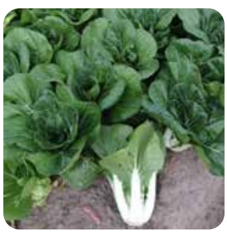
Joi Choi F<sub>1</sub>

Mini green stem pak choi ideal for bunching. Uniform size and excellent shape. Dark green, smooth, elongated leaf shape. Upright stems with compact plant habit. High-end finished product, presenting beautifully when bunched.