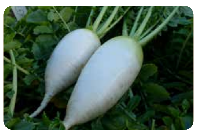
Busan No. 3 F<sub>1</sub>

Green shouldered Korean style daikon radish which has a shorter, rounder shape than the traditional Japanese types. Busan is not strong against bolting, so check local trial data before sowing at any given time.