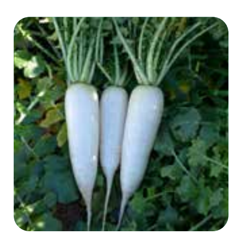
Geisha Girl No. 2 F<sub>1</sub>

A green shoulder Korean style daikon radish with a slighty more slender shape than is typical for this type. Relatively slow bolting. Very crunchy, sweet and spicy flavour.