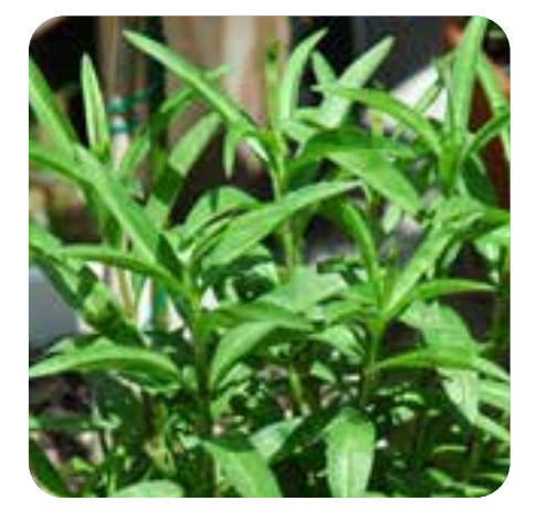
Tarragon - Mexican

A common Asian herb also known as Perilla. Red Shiso has an anise flavour and is slightly less spicy than the green variety. Well suited for micro herb production. Perilla frutescens (approx. 270,000 s/gm)