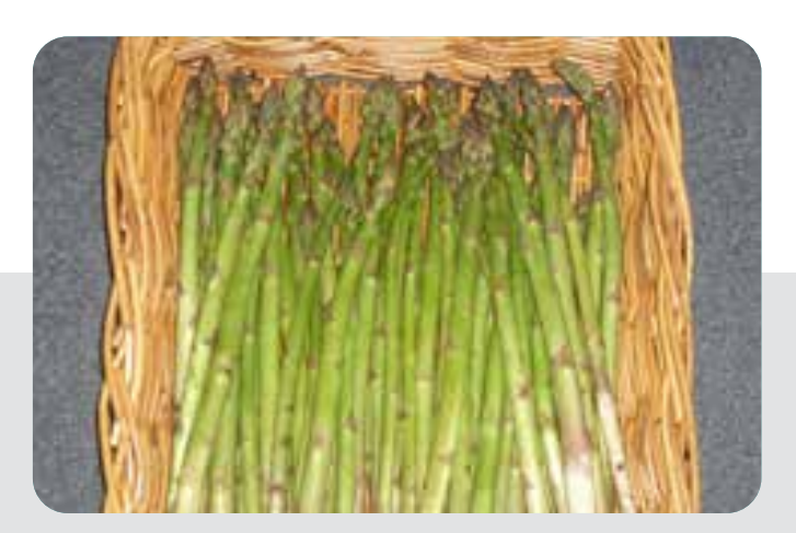
UC 157 F<sub>1</sub>

Standard F1 hybrid asparagus, widely used in the main production areas of Southern Australia and around the world. Produces uniform deep green spears, with high yield potential. Seed is imported for confirmed orders only.