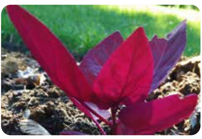
Orach - Red

Common garden mint with a vigorous plant habit. Easy to grow and very aromatic, well suited to micro herb production. Mentha spicata (Approx. 12,000 s/gm)