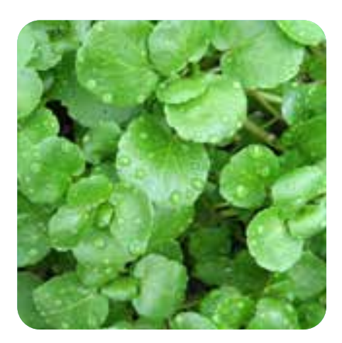
Watercress - True Water

Red veined variety with bright green leaves. Refreshing, citrus sour taste. Leaves have a slight savoy texture and are very attractive as a garnish. Rumex sanguineus (1200-1500 s/gm).