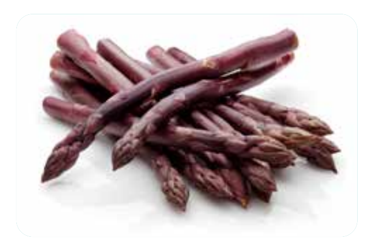
Pacific Purple F,

Well suited for early production of fresh asparagus in warm climates. Very similar in appearance to UC 157, tight spear heads on a tall stem. Seed is imported for confirmed orders only.