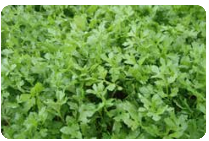
Cress - Curled Wasabi

Cress with dark green broad leaves, growing on a stem. The plants usually grow to about 20cm tall. Does not require as much moisture to grow as watercress. Barbarea verba (500-600 s/gm)