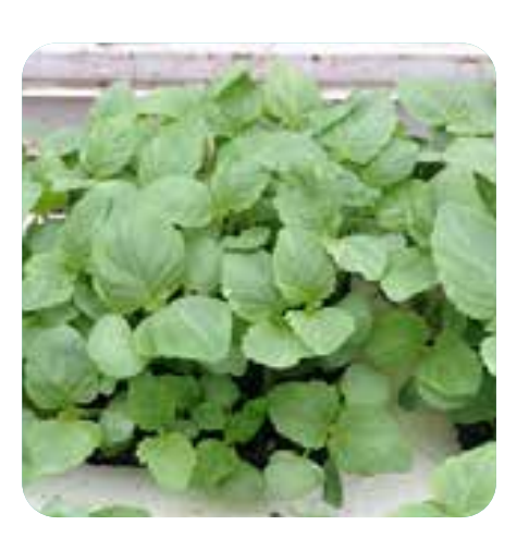
Shiso - Green

Very attractive herb with silvery green leaves. Upright, high yielding plant that can be grown as a perennial in mild areas. Salvia officinalis (120-130 s/gm)