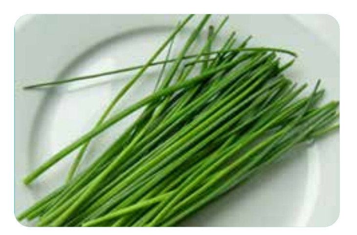
Chives - Medium Onion

Commonly called onion chives, this variety produces dark green cylindrical stems, approximately 20cm tall. Can be grown as a perennial, as they die off in winter and shoot again in spring. Allium schoenoprasum (800-900 s/gm)