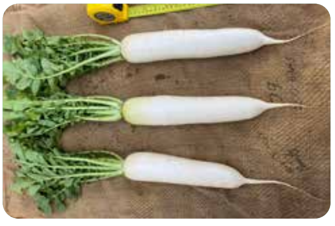
NEW Spring Geisha F<sub>1</sub>

Strong heat tolerance, best suited to late summer and autumn harvest. IR: Fusarium. Approx. 40 x 6.5cm