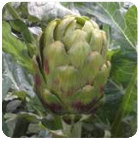
Imperial Star 2

Early maturing variety for fresh market. Green chokes with a slight purple tinge. In Southern Australia, Imperial Star is usually grown as an annual, sowing in spring and harvesting through the following winter.