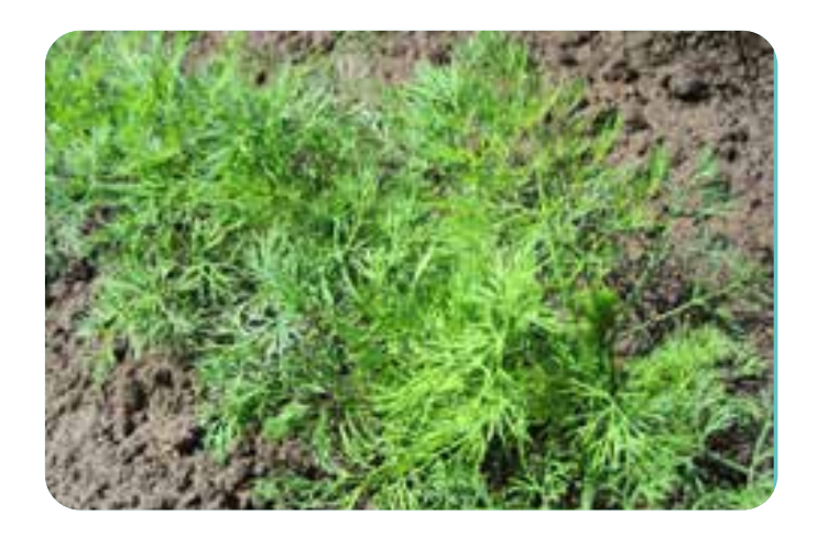
Dill - Bouquet

Bouquet is the original market standard dill. The attractive, dark green plant produces delicate looking leaves, borne on long stems. Anethum graveolens (800-850 s/gm)