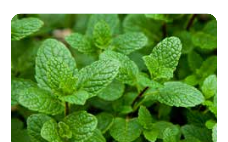
Mint - Spearmint

Common garden mint with a vigorous plant habit. Easy to grow and very aromatic, well suited to micro herb production. Mentha spicata (Approx. 12,000 s/gm)