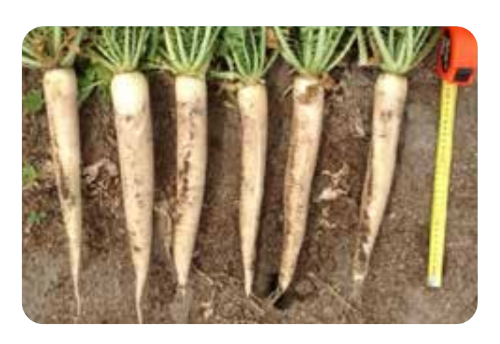
Minowase No.3 F<sub>1</sub>

An April Cross type daikon radish. Pure white root with no green shoulder. Roots are very uniform and smooth, with a long, attractive, evenly tapered shape. Strong dark green tops, relatively slow bolting. Root is approx. 37cm x 6cm.