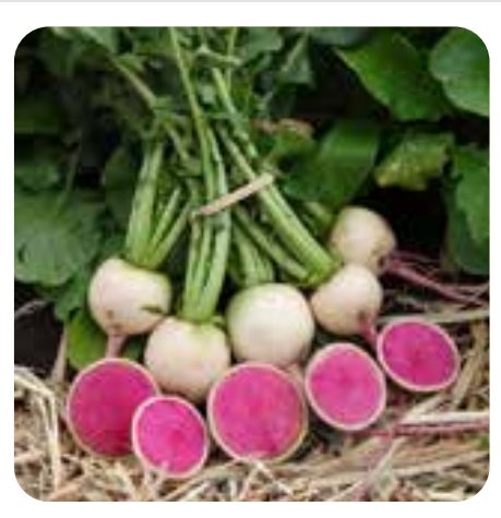
Red Meat -Watermelon Radish

Uniform red globe radish with abundant, pale green leaf. Tops are too vigorous in summer, best grown in the cooler seasons where it is widely used for bunching. This variety is also commonly used for micro herb production.