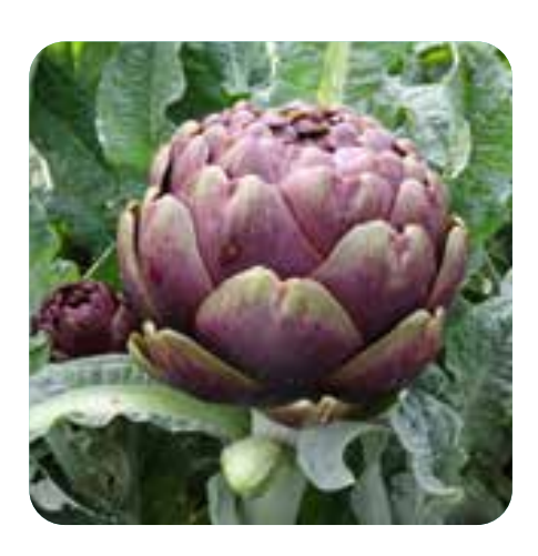
Red Crown F,

An improved selection of the original Imperial Star. Imperial Star 2 is a vigorous plant with a medium to open habit producing elongated globe shaped heads with a slight purple tinge.