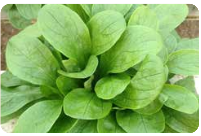
Corn Salad - Mache

Commonly called onion chives, this variety produces dark green cylindrical stems, approximately 20cm tall. Can be grown as a perennial, as they die off in winter and shoot again in spring. Allium schoenoprasum (800-900 s/gm)