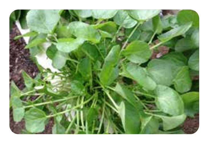
Cress - American Upland

French vegetable, grown for baby leaf or micro greens. Spinach-like growth habit, with a delicate and nuttier flavour than spinach. Mache continues to thrive through cold temperatures. Valerianella locusta (400-450s/gm)