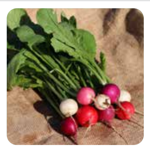
Easter Egg Mix

A mix of round radish roots that develop in shades of white, pink, red and purple and have a mild, delicate flavour. These radishes are round, glossy and stay crisp and mild even when large. Beautiful presentation when bunched.